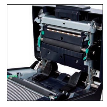
Easy external paper loading with the optional paper roll holder which reduces media loading downtime.